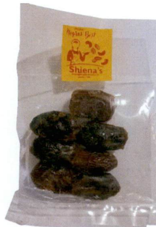
Figure 1. Unregistered SHIENA'S HOMEMADE PRODUCTS ASSUMED AS DATES

The Food and Drug Administration (FDA) warns all healthcare professionals and the general public NOT TO PURCHASE AND CONSUME the unregistered food product: