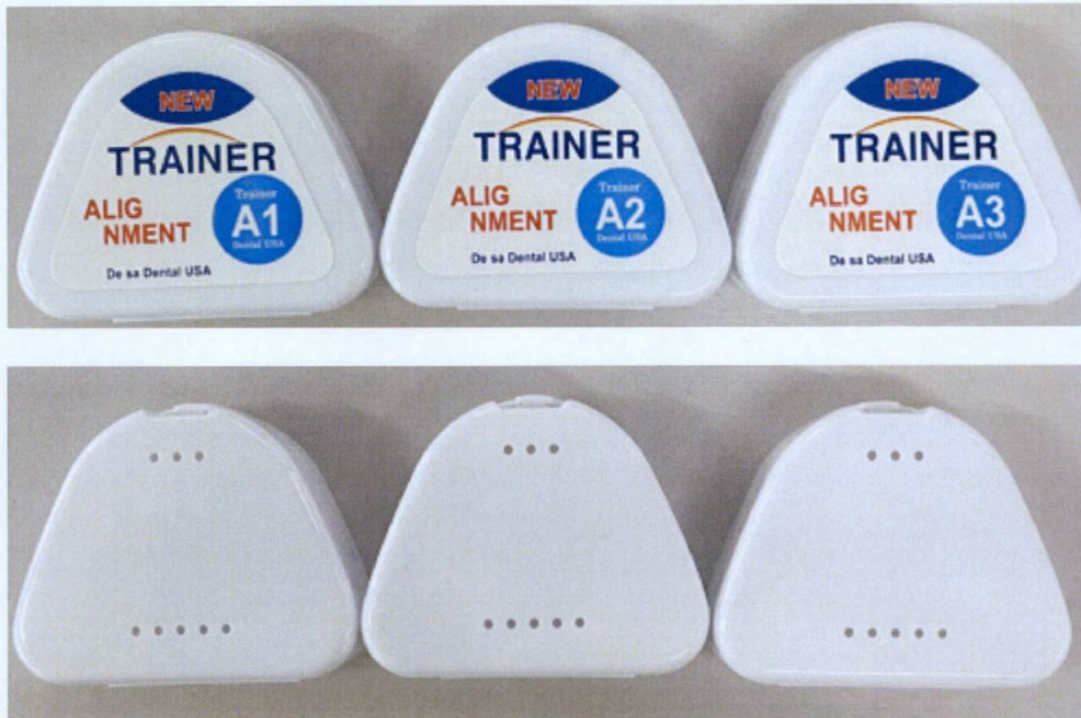
Figure 1. Unnotified New Trainer Alignment

The Food and Drug Administration (FDA) warns all healthcare professionals and the general public NOT TO PURCHASE AND USE the unnotified medical device product: