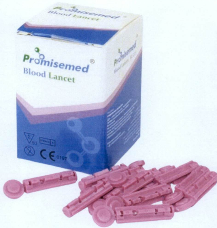
Figure 2. Unregistered Promisemed, Blood Lancet advertised at Lazada.com.ph

The FDA verified through post-marketing surveillance that the above-mentioned medical device products are not registered, and no corresponding Product Registration Certificates have been issued. Pursuant to the Republic Act No. 9711, otherwise known as the “Food and Drug Administration Act of 2009”, the manufacture, importation, exportation, sale, offering for sale, distribution, transfer, non-consumer use, promotion, advertising, or sponsorship of health products without the proper authorization is prohibited.