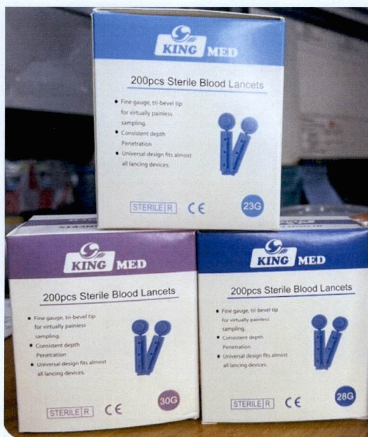
Figure 1. Unregistered King Med, Sterile Blood Lancets advertised at Lazada.com.ph

The Food and Drug Administration (FDA) warns all healthcare professionals and the general public NOT TO PURCHASE AND USE the unregistered medical device products: