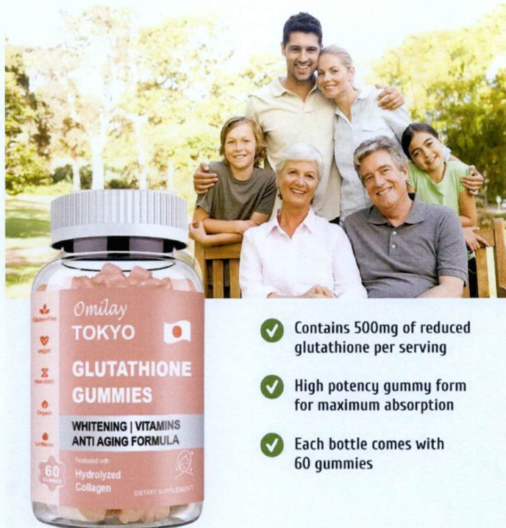
Figure 2. Unregistered OMILAY TOKYO Glutathione Gummies Dietary Supplements