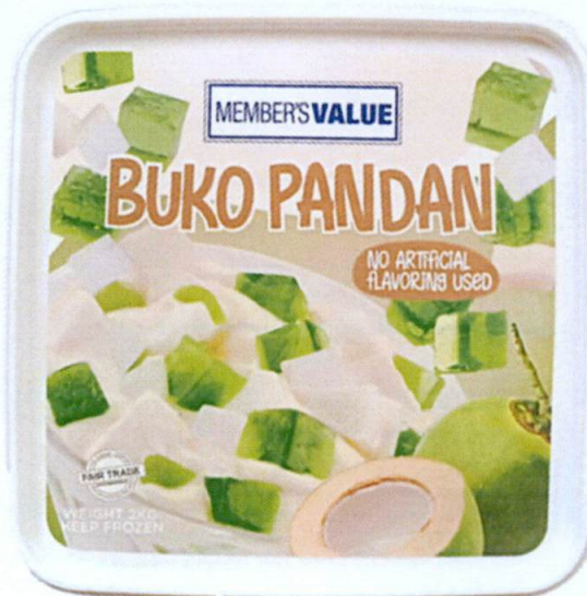
Figure 1. Unregistered MEMBER'S VALUE Buko Pandan Ice Cream

The Food and Drug Administration (FDA) warns all healthcare professionals and the general public NOT TO PURCHASE AND CONSUME the following unregistered food product and food supplements: