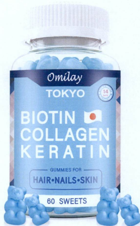
Figure 5. Unregistered OMILAY TOKYO Biotin, Collagen, Keratin Gummies Dietary Supplements