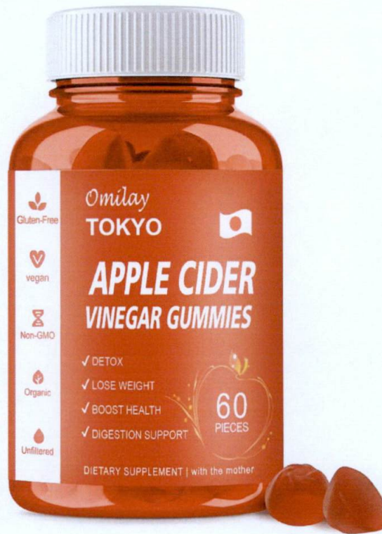
Figure 4. Unregistered OMILAY TOKYO Apple Cider Vinegar Gummies Dietary Supplements