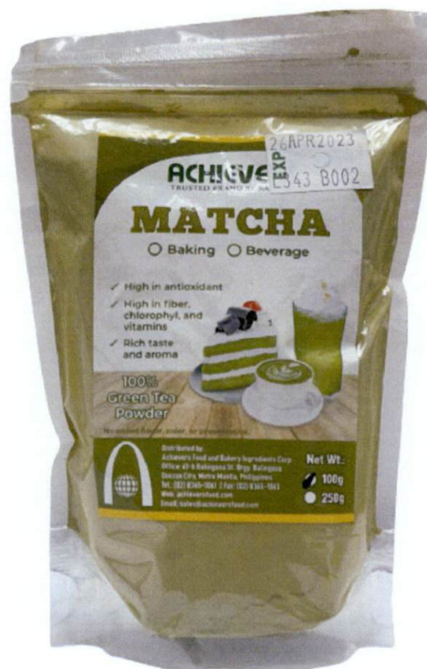
Figure 1. Unregistered ACHIEVERS Matcha Green Tea Powder

The Food and Drug Administration (FDA) warns all healthcare professionals and the general public NOT TO PURCHASE AND CONSUME the unregistered food product: