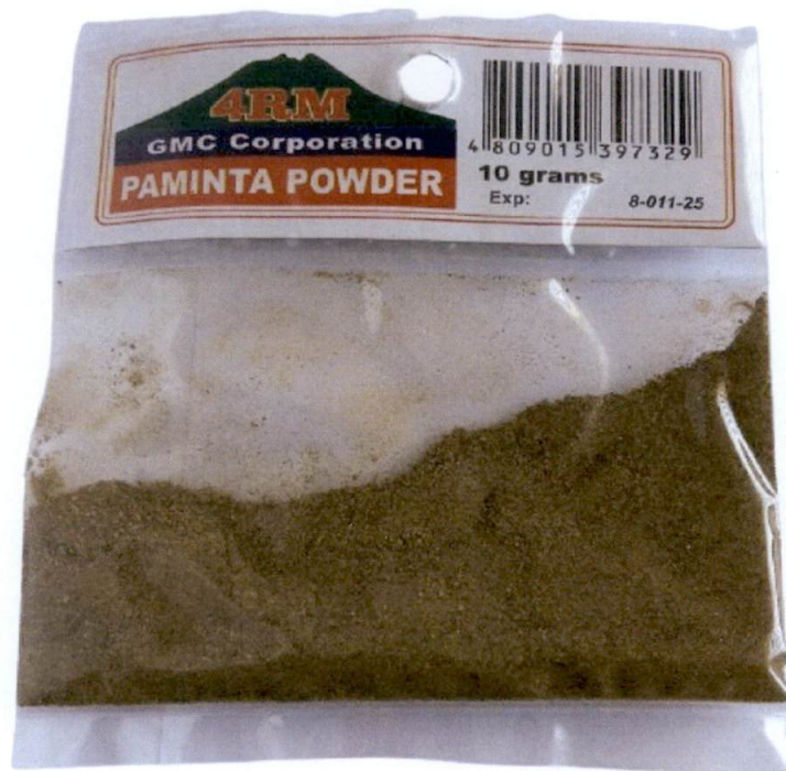
Figure 1. Unregistered 4RM Paminta Powder

The Food and Drug Administration (FDA) warns all healthcare professionals and the general public NOT TO PURCHASE AND CONSUME the unregistered food product: