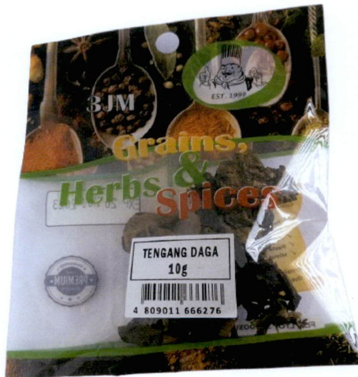
Figure 1. Unregistered 3JM GRAINS, HERBS & SPICES Tengang Daga

The Food and Drug Administration (FDA) warns all healthcare professionals and the general public NOT TO PURCHASE AND CONSUME the unregistered food product: