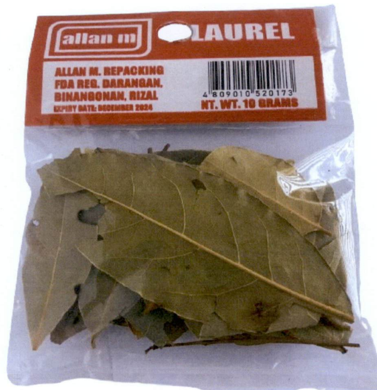
Figure 1. Unregistered ALLAN M Laurel

The Food and Drug Administration (FDA) warns all healthcare professionals and the general public NOT TO PURCHASE AND CONSUME the unregistered food product: