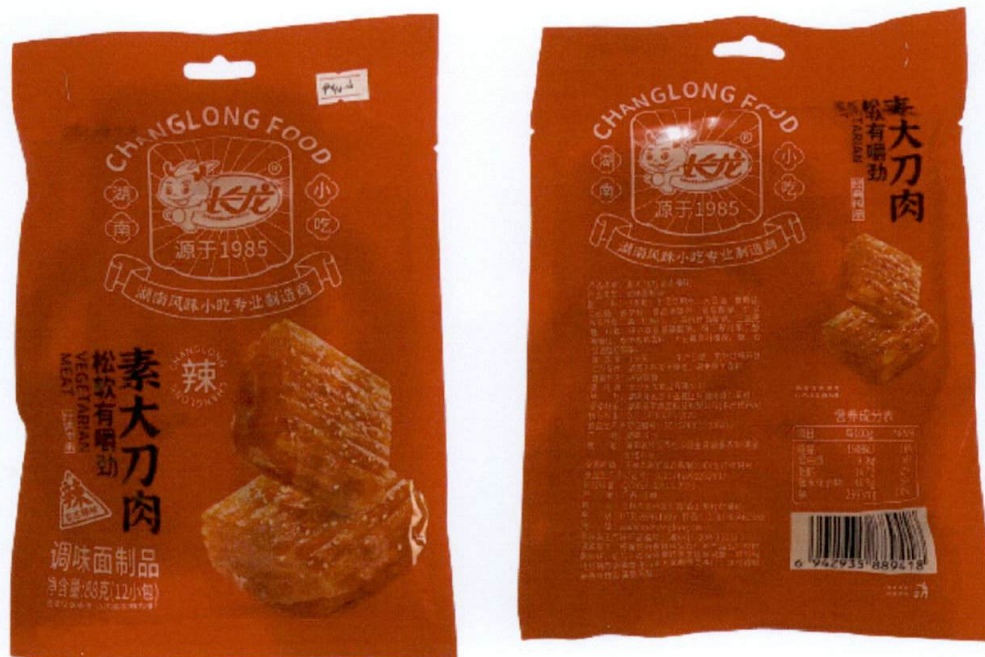
Figure 1. Unregistered CHANGLONG FOOD Vegetarian Meat (In Foreign Language)

The Food and Drug Administration (FDA) warns all healthcare professionals and the general public NOT TO PURCHASE AND CONSUME the unregistered food product: