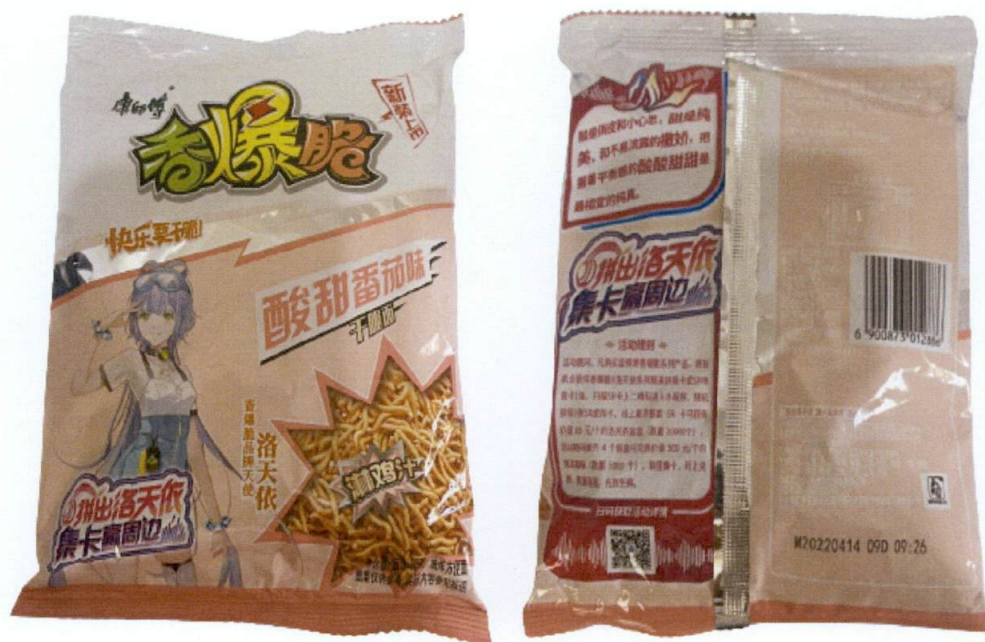
Figure 1. Unregistered Crispy Noodle-Like Food Product with Cartoon Character in Pink Packaging (In Foreign Language)

The Food and Drug Administration (FDA) warns all healthcare professionals and the general public NOT TO PURCHASE AND CONSUME the unregistered food product: