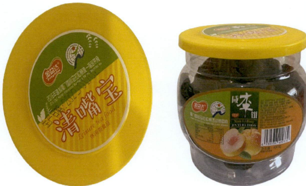
Figure 1. Unregistered JIN YI DA FOOD Xian Li Bing Leisure Tea Food (In Foreign Language)

The Food and Drug Administration (FDA) warns all healthcare professionals and the general public NOT TO PURCHASE AND CONSUME the unregistered food product: