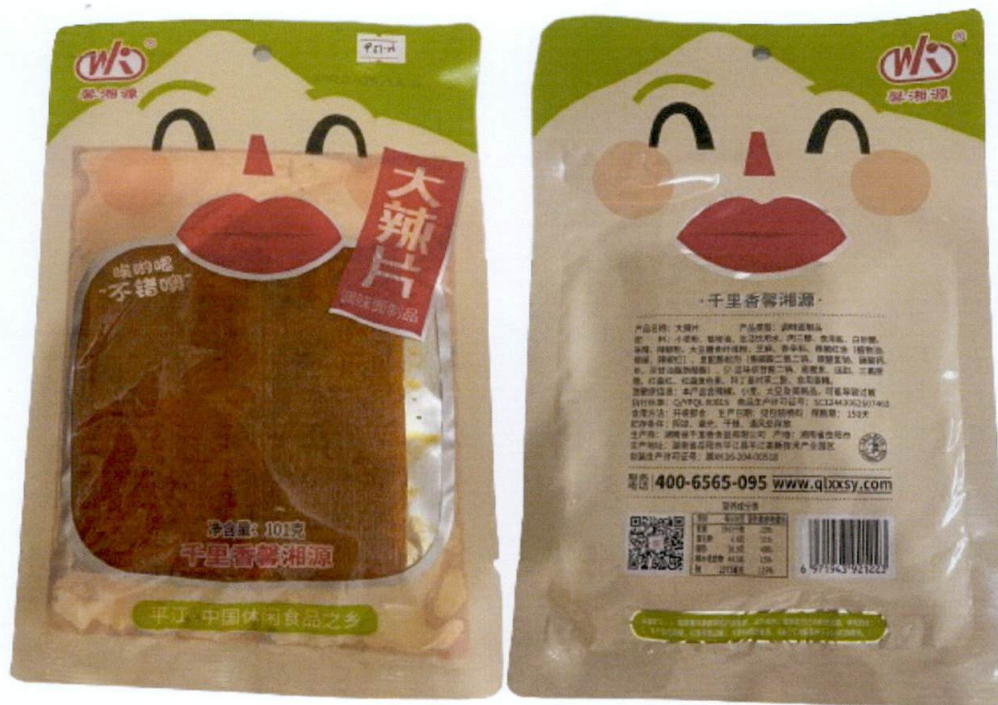
Figure 1. Unregistered Food Product with Face Character in Peach and Clear Packaging (In Foreign Language)

The Food and Drug Administration (FDA) warns all healthcare professionals and the general public NOT TO PURCHASE AND CONSUME the unregistered food product: