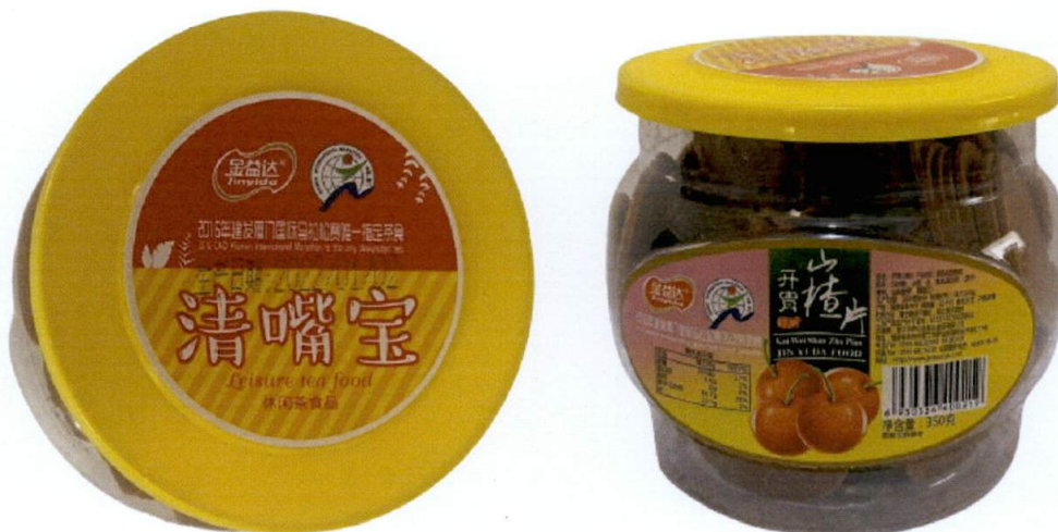
Figure 1. Unregistered JIN YI DA FOOD Kai Wei Shan Zha Pian Leisure Tea Food (In Foreign Language)

The Food and Drug Administration (FDA) warns all healthcare professionals and the general public NOT TO PURCHASE AND CONSUME the unregistered food product: