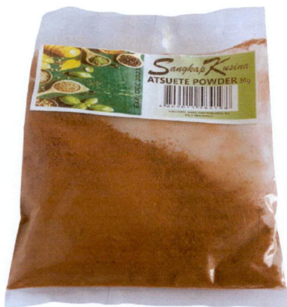
Figure 1. Unregistered SANGKAP KUSINA Atsuete Powder

The Food and Drug Administration (FDA) warns all healthcare professionals and the general public NOT TO PURCHASE AND CONSUME the unregistered food product: