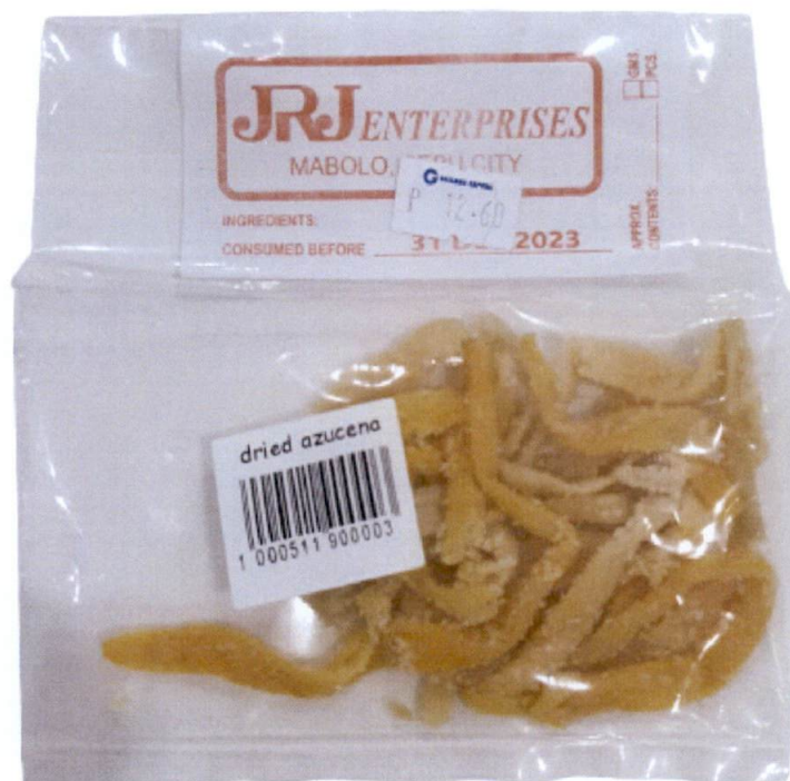
Figure 1. Unregistered JRJ ENTERPRISES Dried Azucena

The Food and Drug Administration (FDA) warns all healthcare professionals and the general public NOT TO PURCHASE AND CONSUME the unregistered food product: