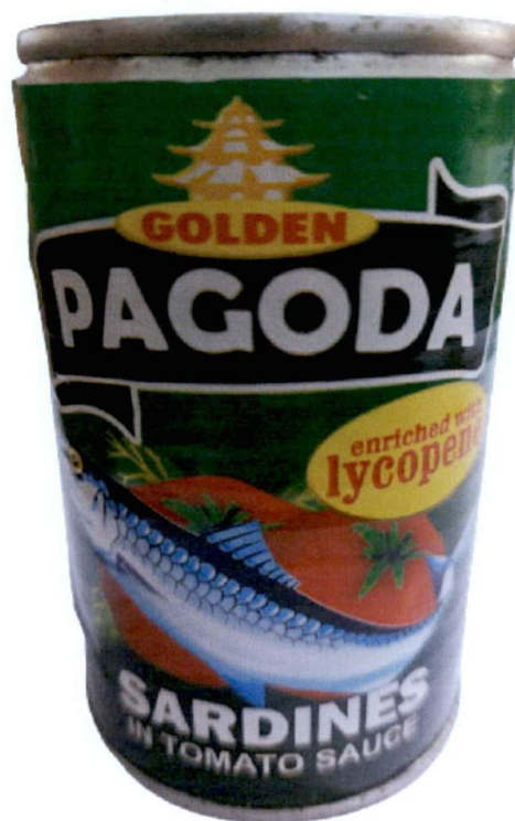
Figure 1. Unregistered GOLDEN PAGODA Sardines in Tomato Sauce

The Food and Drug Administration (FDA) warns all healthcare professionals and the general public NOT TO PURCHASE AND CONSUME the unregistered food product: