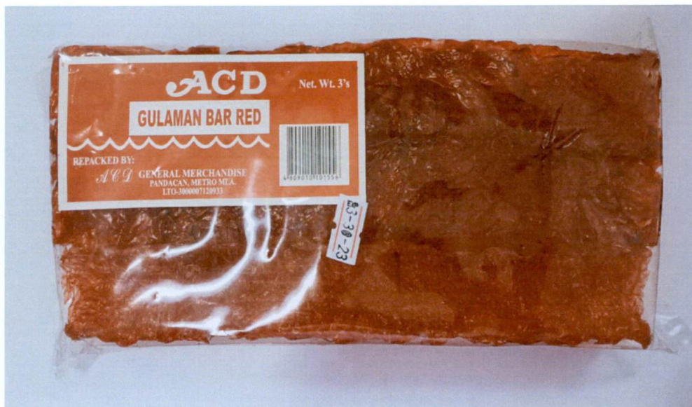
Figure 1. Unregistered ACD Gulaman Bar Red

The Food and Drug Administration (FDA) warns all healthcare professionals and the general public NOT TO PURCHASE AND CONSUME the unregistered food product: