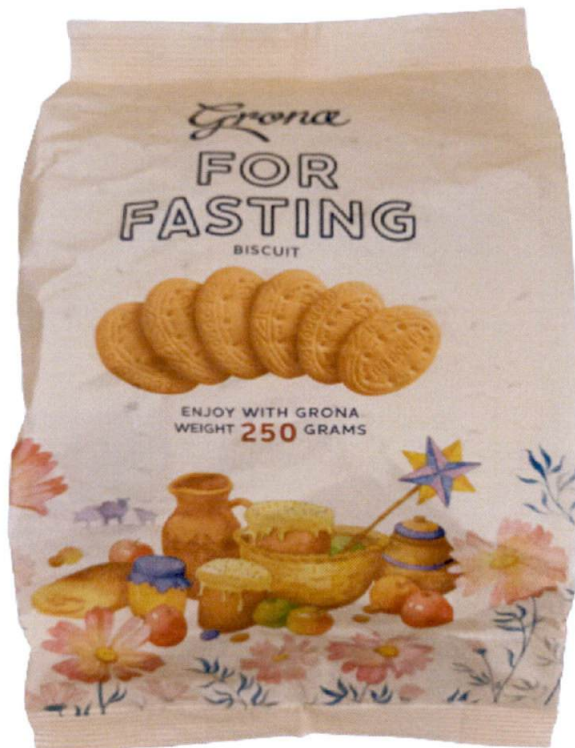
Figure 1. Unregistered GRONA For Fasting Biscuit

The Food and Drug Administration (FDA) warns all healthcare professionals and the general public NOT TO PURCHASE AND CONSUME the unregistered food product: