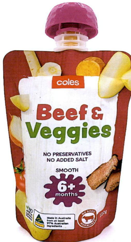
Figure 1. Unregistered COLES Beef & Veggies 6+ Months

The Food and Drug Administration (FDA) warns all healthcare professionals and the general public NOT TO PURCHASE AND CONSUME the unregistered food product: