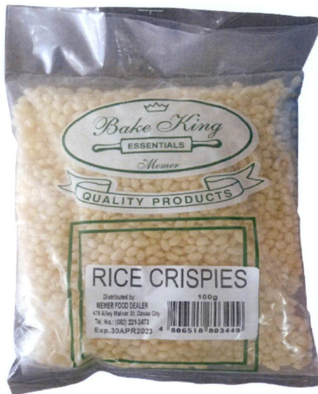
Figure 1. Unregistered MEMER BAKE KING ESSENTIALS Rice Crispies

The Food and Drug Administration (FDA) warns all healthcare professionals and the general public NOT TO PURCHASE AND CONSUME the unregistered food product: