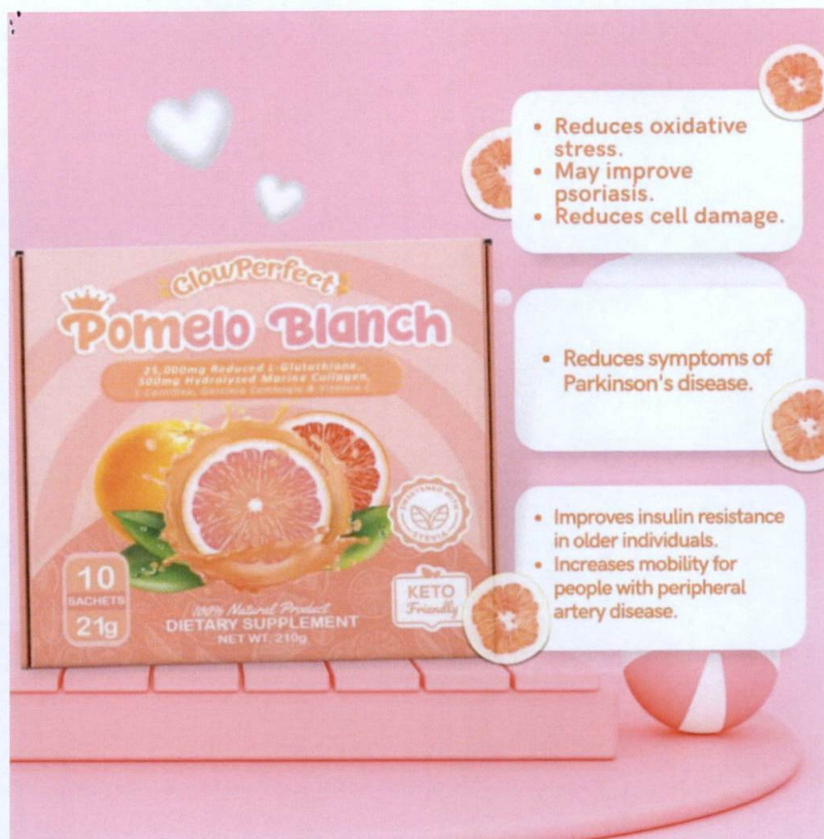
Figure 4. Unregistered GLOW PERFECT POMELO BLANCH 25,000mg Reduced L-Glutathione, 500mg Hydrolyzed Marine Collagen (L-Carnitine, Collagen & Vitamin C) Dietary Supplement