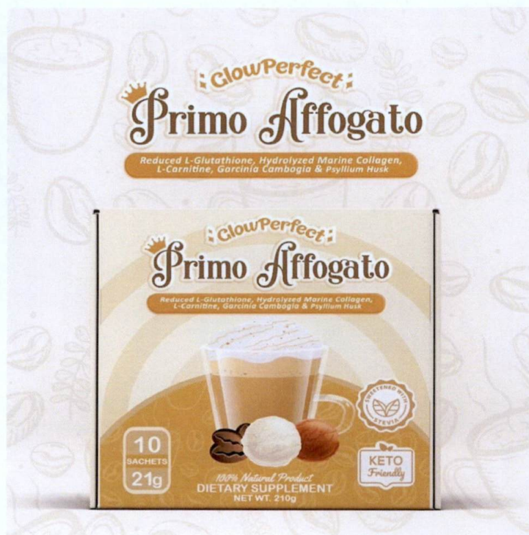
Figure 3. Unregistered GLOW PERFECT PRIMO AFFOGATO Reduced L-Glutathione, Hydrolyzed Marine Collagen, L-Carnitine, Garcinia Cambogia Dietary Supplement