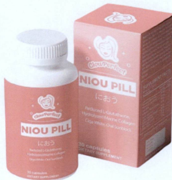
Figure 5. Unregistered GLOW PERFECT NIOU PILL Reduced L-Glutathione, Hydrolyzed Marine Collagen, Giga White, Oral Sunblock Dietary Supplement