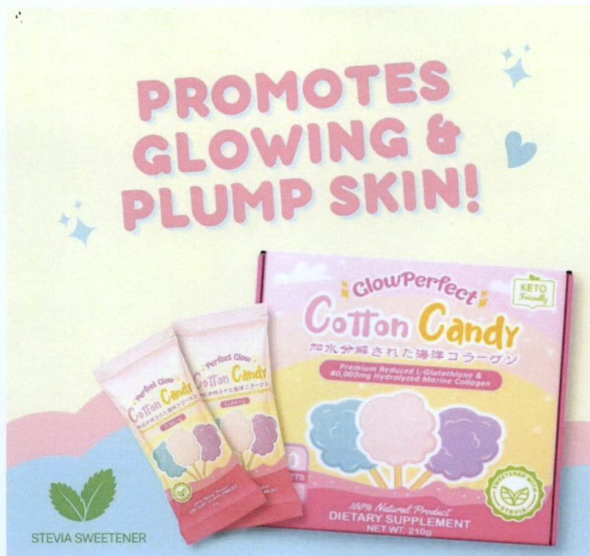
Figure 2. Unregistered GLOW PERFECT COTTON CANDY Premium Reduced L-Glutathione & 80,000mg Hydrolyzed Marine Collagen Dietary Supplement