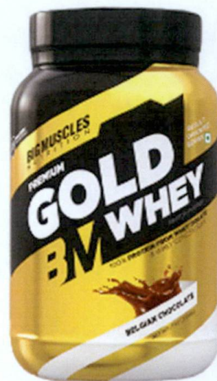
Figure 1. Unregistered BIG MUSCLES NUTRITION Premium Gold Whey-Belgian Chocolate

The Food and Drug Administration (FDA) warns all healthcare professionals and the general public NOT TO PURCHASE AND CONSUME the following unregistered food product and food supplements: