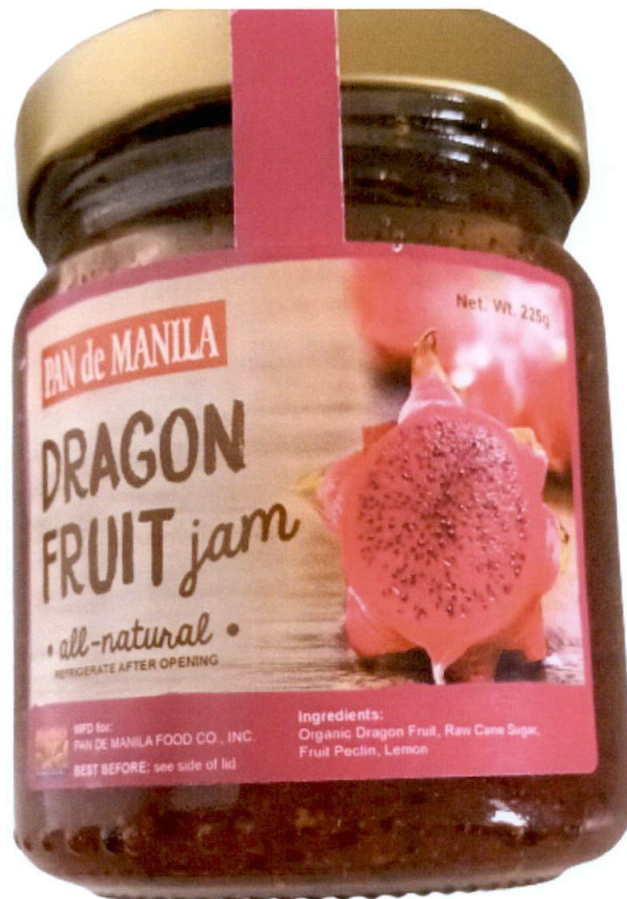
Figure 1. Unregistered PAN DE MANILA Dragon Fruit Jam

The Food and Drug Administration (FDA) warns all healthcare professionals and the general public NOT TO PURCHASE AND CONSUME the unregistered food product: