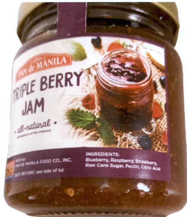
Figure 1. Unregistered PAN DE MANILA Triple Berry Jam

The Food and Drug Administration (FDA) warns all healthcare professionals and the general public NOT TO PURCHASE AND CONSUME the unregistered food product: