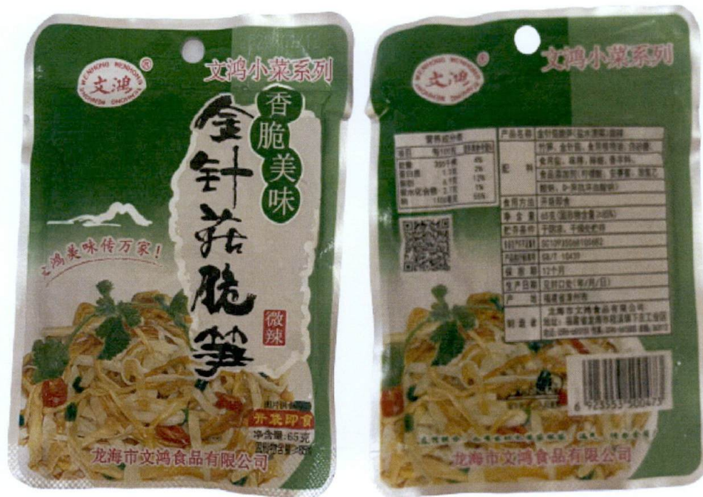
Figure 1. Unregistered WENHONG Product in Green Packaging with Printed Picture of Vegetable (In Foreign Language)

The Food and Drug Administration (FDA) warns all healthcare professionals and the general public NOT TO PURCHASE AND CONSUME the unregistered food product: