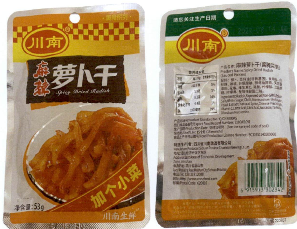
Figure 1. Unregistered (IN FOREIGN LANGUAGE) Spicy Dried Radish (Sauced Pickles)

The Food and Drug Administration (FDA) warns all healthcare professionals and the general public NOT TO PURCHASE AND CONSUME the unregistered food product: