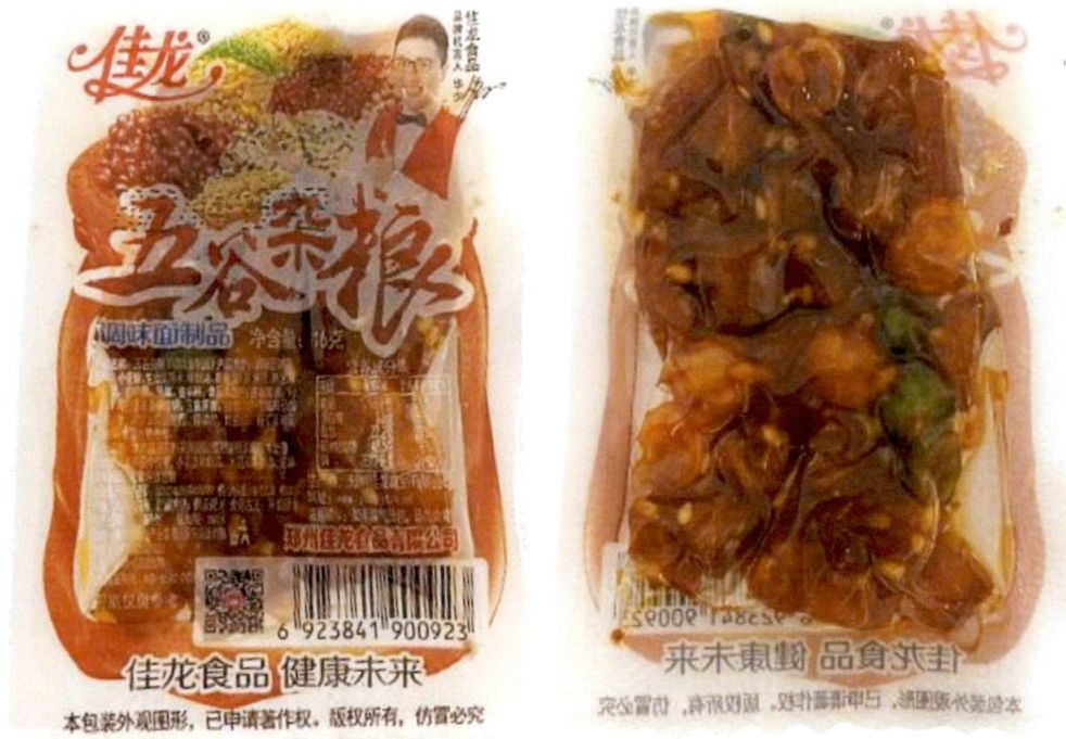
Figure 1. Unregistered (IN FOREIGN LANGUAGE) Product in Red and White Packaging with Image of Beans and Person with Glasses (In Foreign Language)

The Food and Drug Administration (FDA) warns all healthcare professionals and the general public NOT TO PURCHASE AND CONSUME the unregistered food product: