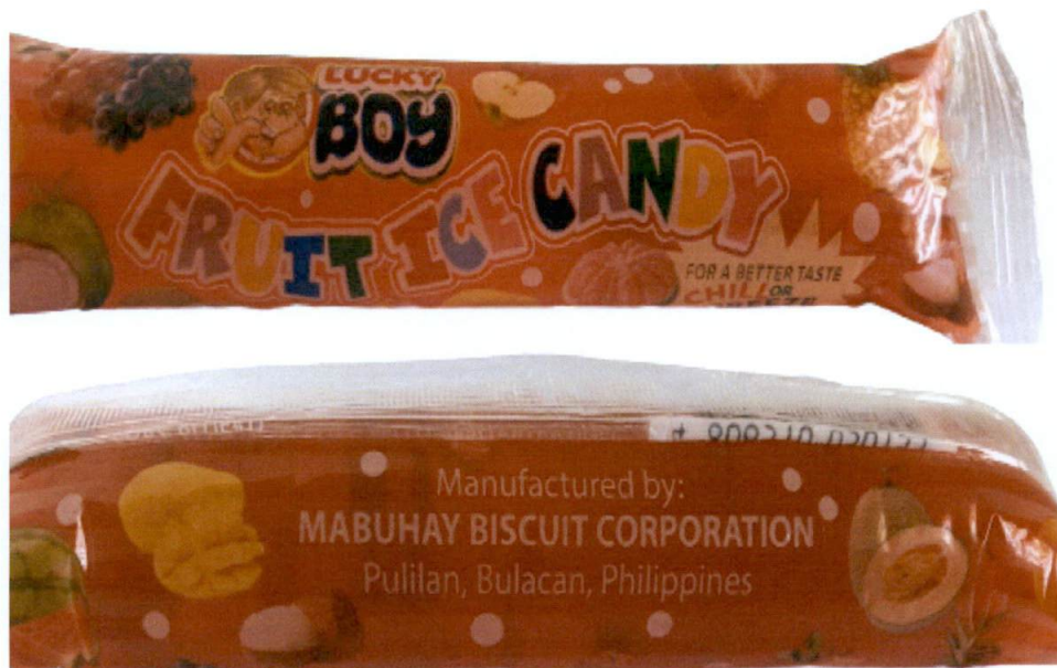
Figure 1. Unregistered LUCKY BOY Fruit Ice Candy

The Food and Drug Administration (FDA) warns all healthcare professionals and the general public NOT TO PURCHASE AND CONSUME the unregistered food product: