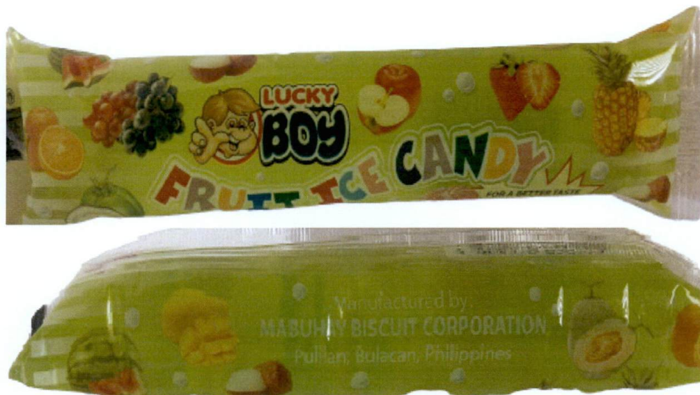
Figure 1. Unregistered LUCKY BOY Fruit Ice Candy - Green

The Food and Drug Administration (FDA) warns all healthcare professionals and the general public NOT TO PURCHASE AND CONSUME the unregistered food product: