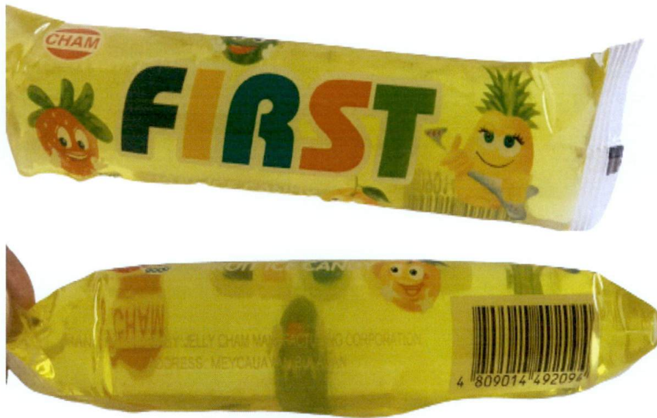
Figure 1. Unregistered CHAM FIRST Fruit Ice Candy

The Food and Drug Administration (FDA) warns all healthcare professionals and the general public NOT TO PURCHASE AND CONSUME the unregistered food product: