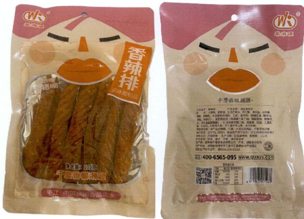
Figure 1. Unregistered (IN FOREIGN LANGUAGE) Product in Orange and Pink Packaging with Lips-like Image (In Foreign Language)

The Food and Drug Administration (FDA) warns all healthcare professionals and the general public NOT TO PURCHASE AND CONSUME the unregistered food product: