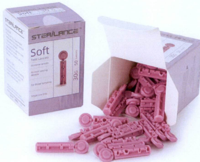
Figure 1. Unregistered Sterilance Soft Twist Lancet advertised at Lazada.com.ph

The Food and Drug Administration (FDA) warns all healthcare professionals and the general public NOT TO PURCHASE AND USE the unregistered medical device product: