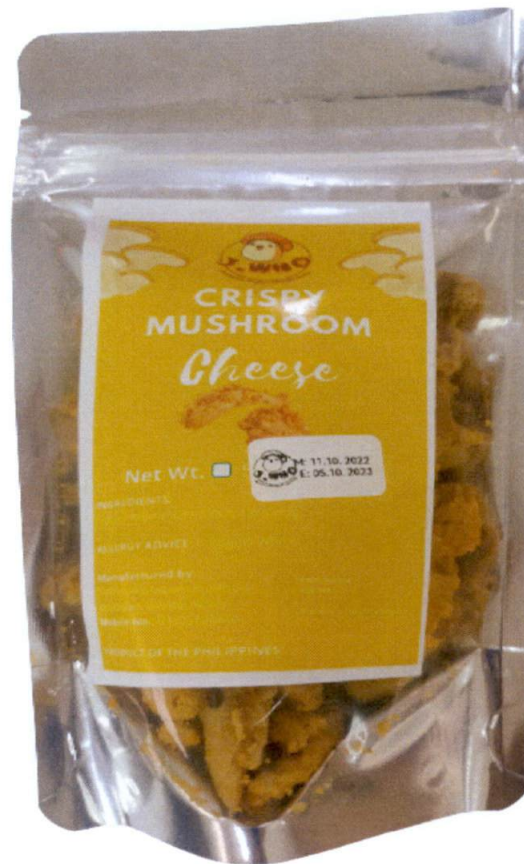
Figure 1. Unregistered J. WHO Crispy Mushroom Cheese

The Food and Drug Administration (FDA) warns all healthcare professionals and the general public NOT TO PURCHASE AND CONSUME the unregistered food product: