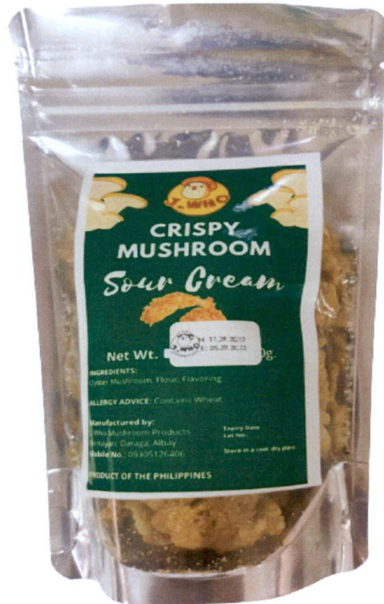
Figure 1. Unregistered J. WHO Crispy Mushroom Sour Cream

The Food and Drug Administration (FDA) warns all healthcare professionals and the general public NOT TO PURCHASE AND CONSUME the unregistered food product: