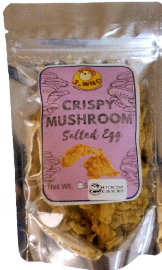
Figure 1. Unregistered J. WHO Crispy Mushroom Salted Egg

The Food and Drug Administration (FDA) warns all healthcare professionals and the general public NOT TO PURCHASE AND CONSUME the unregistered food product: