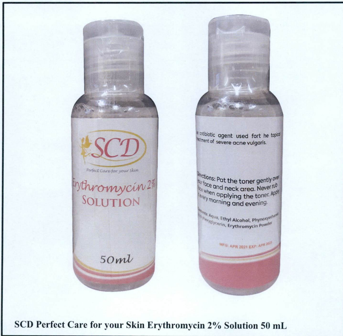
Figure 1: Unregistered drug product

The Food and Drug Administration (FDA) advises the public against the purchase and use of the unregistered drug product: