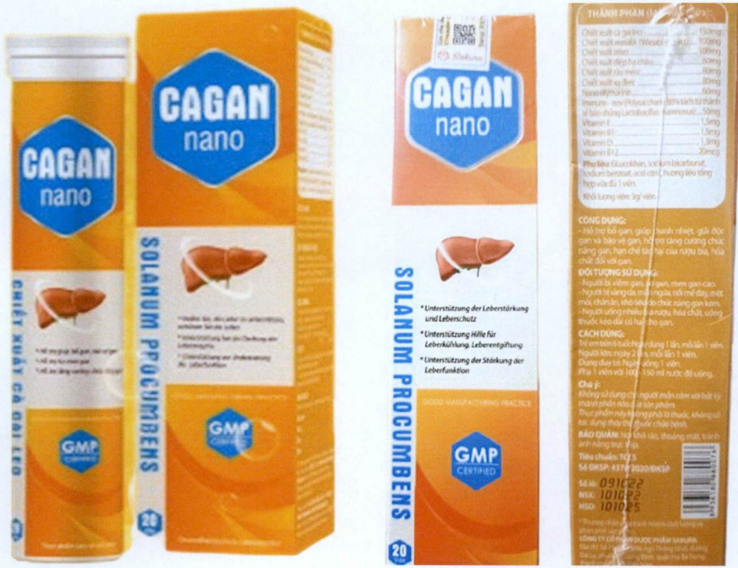
Figure 3. Unregistered CAGAN NANO Solanum Procumbens