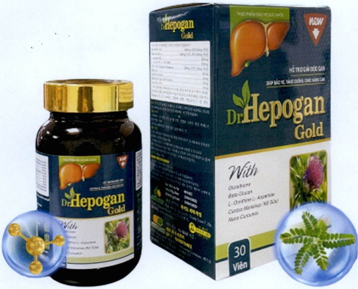
Figure 2. Unregistered DR. HEPOGAN Gold