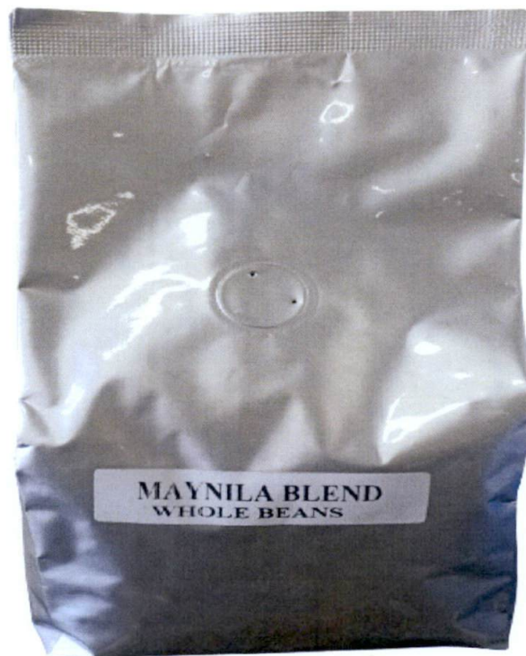
Figure 1. Unregistered MAYNILA BLEND Assumed Coffee Product In Silver Foil Pack

The Food and Drug Administration (FDA) warns all healthcare professionals and the general public NOT TO PURCHASE AND CONSUME the unregistered food product: