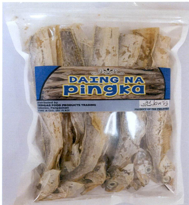
Figure 1. Unregistered UNBRANDED Daing na Pingka

The Food and Drug Administration (FDA) warns all healthcare professionals and the general public NOT TO PURCHASE AND CONSUME the unregistered food product: