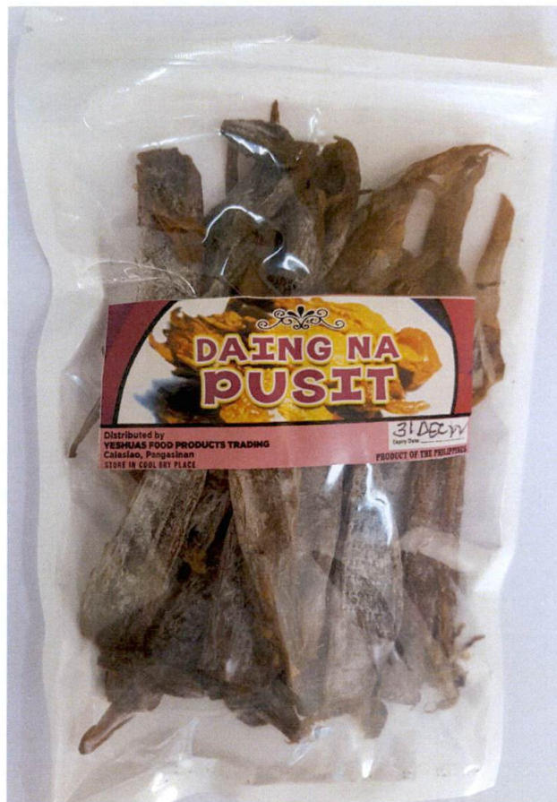
Figure 1. Unregistered UNBRANDED Daing na Pusit

The Food and Drug Administration (FDA) warns all healthcare professionals and the general public NOT TO PURCHASE AND CONSUME the unregistered food product: