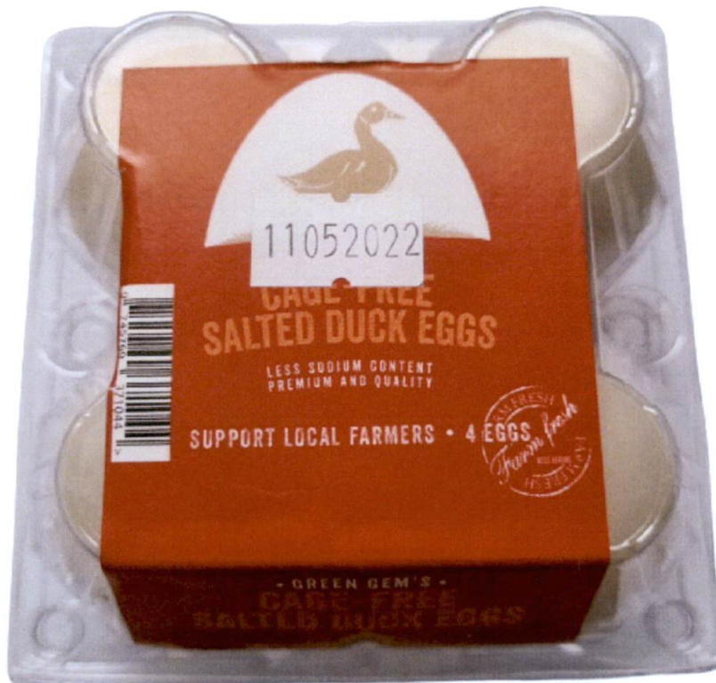
Figure 1. Unregistered GREEN GEM'S Cage Free Salted Duck Eggs

The Food and Drug Administration (FDA) warns all healthcare professionals and the general public NOT TO PURCHASE AND CONSUME the unregistered food product: