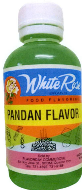
Figure 1. Unregistered WHITE ROSE BRAND Food Flavoring Pandan Flavor

The Food and Drug Administration (FDA) warns all healthcare professionals and the general public NOT TO PURCHASE AND CONSUME the unregistered food product: