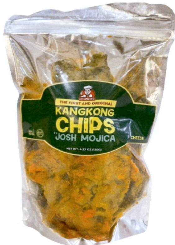
Figure 1. Unregistered CHOWDING The First and Original Kangkong Chips Cheese

The Food and Drug Administration (FDA) warns all healthcare professionals and the general public NOT TO PURCHASE AND CONSUME the unregistered food product: