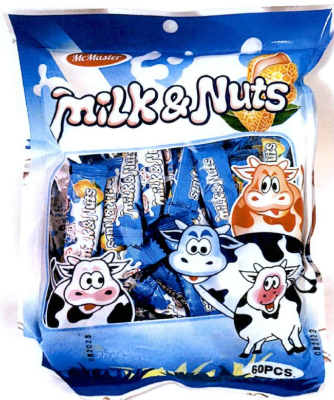
Figure 1. Unregistered MC MASTER Milk & Nuts

The Food and Drug Administration (FDA) warns all healthcare professionals and the general public NOT TO PURCHASE AND CONSUME the unregistered food product: