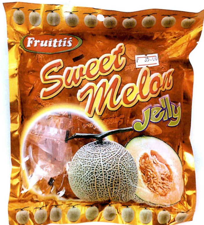
Figure 1. Unregistered FRUITTIS Sweet Melon Jelly

The Food and Drug Administration (FDA) warns all healthcare professionals and the general public NOT TO PURCHASE AND CONSUME the unregistered food product: