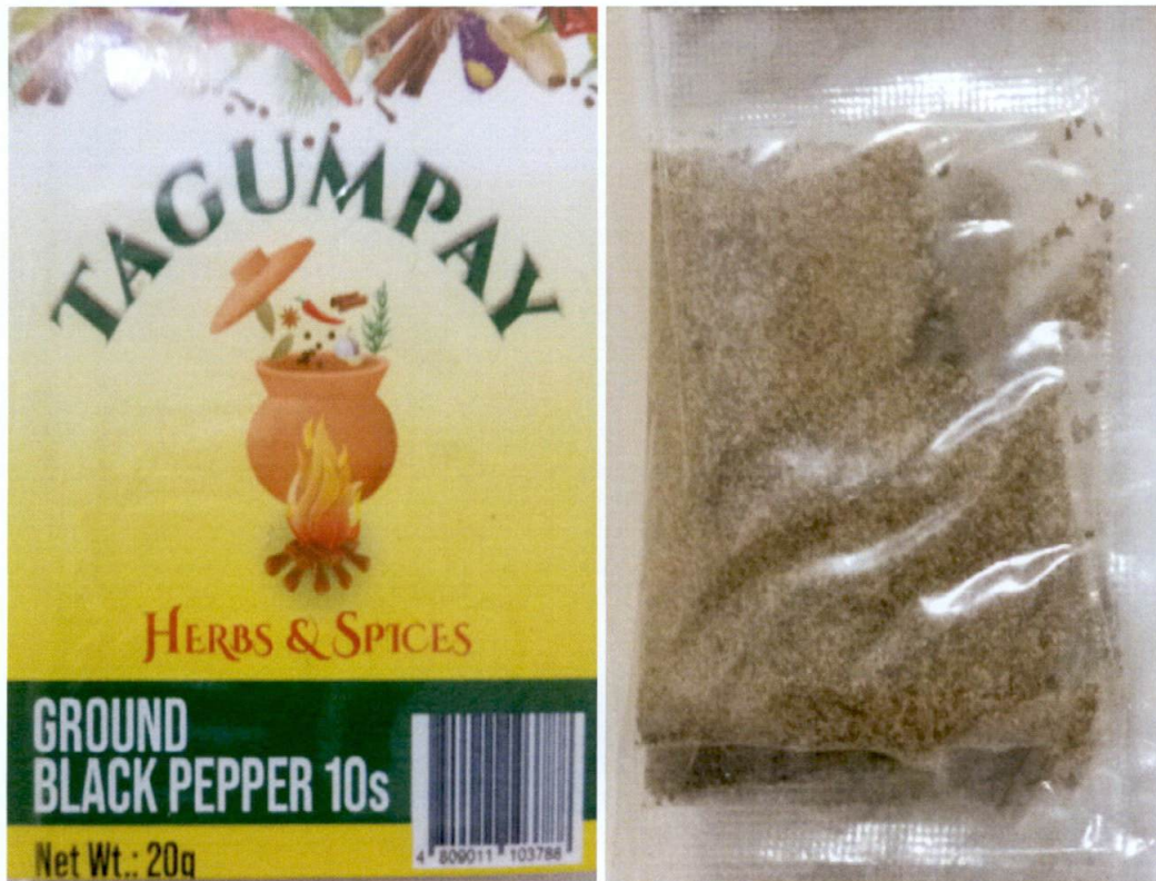
Figure 1. Unregistered TAGUMPAY HERBS & SPICES Ground Black Pepper

The Food and Drug Administration (FDA) warns all healthcare professionals and the general public NOT TO PURCHASE AND CONSUME the unregistered food product: