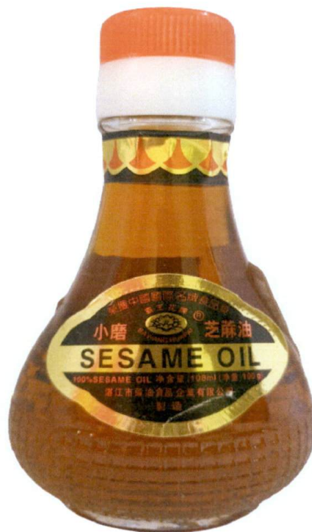
Figure 1. Unregistered SESAME OIL In Foreign Language

The Food and Drug Administration (FDA) warns all healthcare professionals and the general public NOT TO PURCHASE AND CONSUME the unregistered food product: