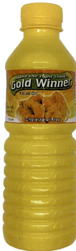
Figure 1. Unregistered GOLD WINNER Palm Oil

The Food and Drug Administration (FDA) warns all healthcare professionals and the general public NOT TO PURCHASE AND CONSUME the unregistered food product: