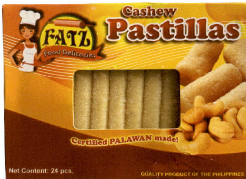
Figure 1. Unregistered FATZ FOOD DELICACIES Cashew Pastillas

The Food and Drug Administration (FDA) warns all healthcare professionals and the general public NOT TO PURCHASE AND CONSUME the unregistered food product: