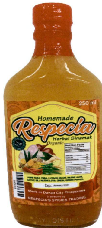
Figure 1. Unregistered HOMEMADE RESPECIA HERBAL SINAMAK

The Food and Drug Administration (FDA) warns all healthcare professionals and the general public NOT TO PURCHASE AND CONSUME the unregistered food product: