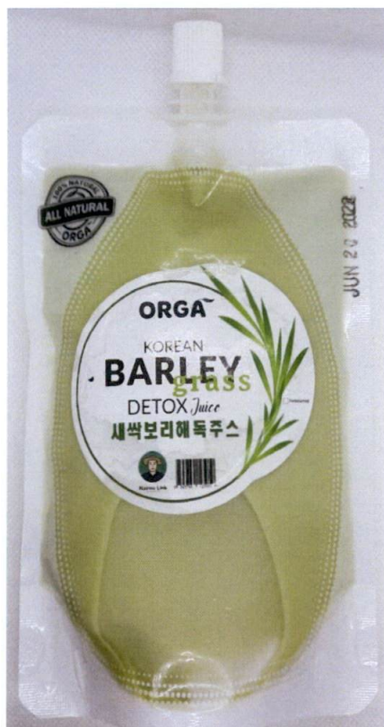
Figure 1. Unregistered ORGA Korean Barley Grass Detox Juice

The Food and Drug Administration (FDA) warns all healthcare professionals and the general public NOT TO PURCHASE AND CONSUME the unregistered food product: